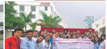
Coca Cola, Greater Noida