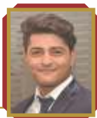
Akshay Café Coffee Day 8.5 LPA