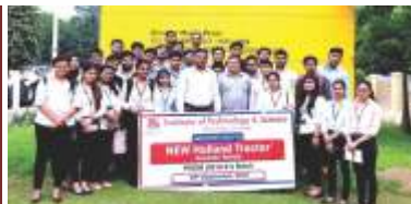
New Holland Tractor, Greater Noida