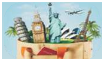
Free Foreign Tour