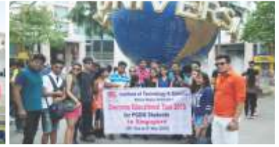
Overseas Tour @ Singapore