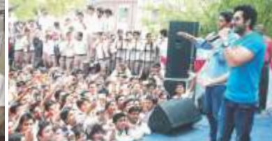
Ayushmann Khurana @I.T.S