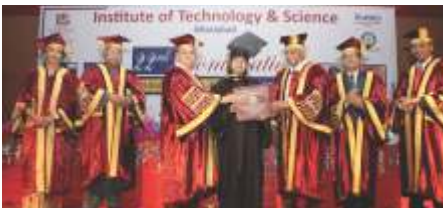
General V.K. Singh @ Convocation PGDM Batch (2017-19)