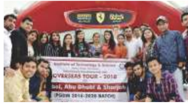
Overseas Tour @ Dubai