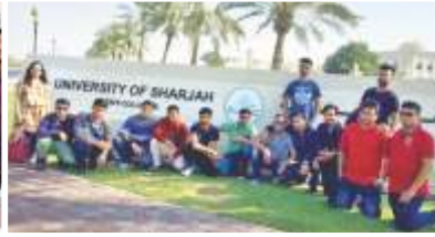
Overseas Tour @ Dubai, Abu Dhabi and Sharjah